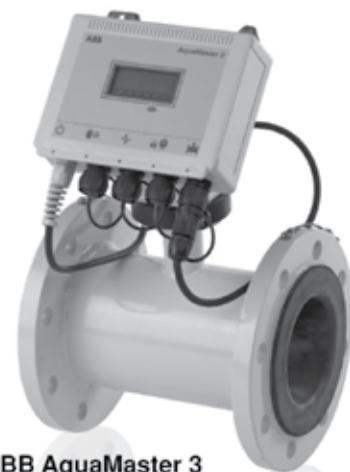
ABB AquaMaster 3