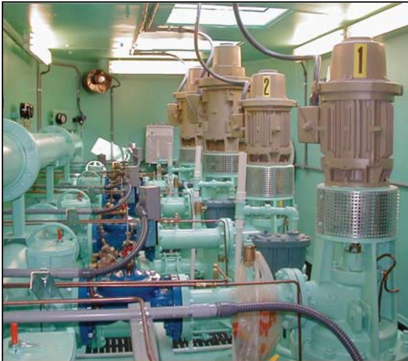
(Above) EFI factory built pump station, installed and operational in a fraction of the time it takes to build a pump station on site.